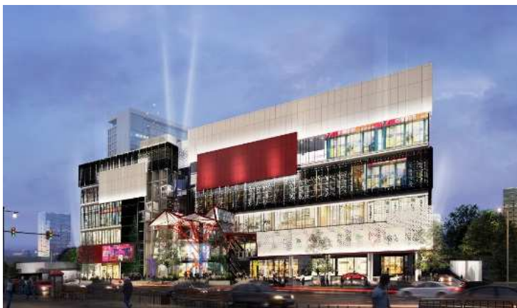
(Artist's image of the facility)